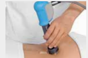
Low back pain