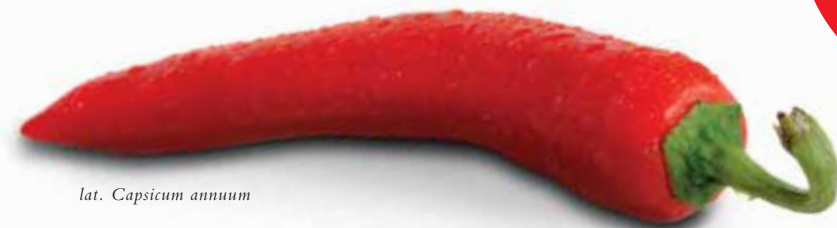
lat. Capsicum annuum